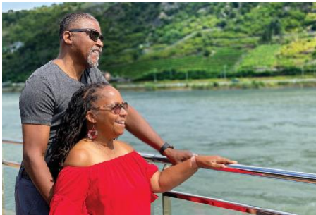
Enjoy fresh air and scenic views