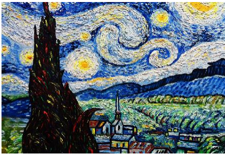
Trace the footsteps of Van Gogh